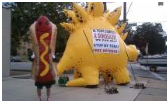
Picture of the Dinosaur and our Hot Dog (Jake) during the Lakewood City Wide Street Sale held on June 26th... If you missed it, you missed out on some great Hot Dogs and some fun!!

There are many more features in this program than we have space to go in to, for instance if you are the type that can never think a strong password, you can have the program generate one for you. For complete documentation for the product you can go to this web address: http://keepass.info/help/base/index.html or you can click on help in the program and it will redirect you to the documentation page.